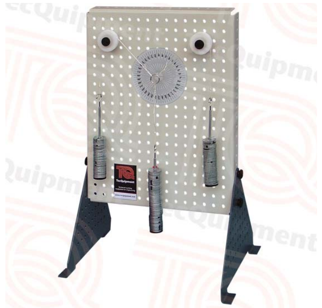
Typical kit shown fitted to Work Panel