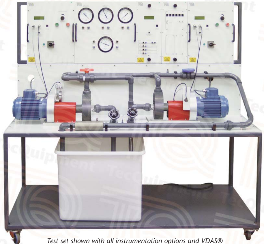
Test set shown with all instrumentation options and VDAS®