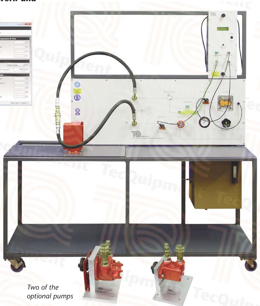
Two of the optional pumps