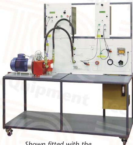
Shown fitted with the Universal Dynamometer (MFP100) and a pump