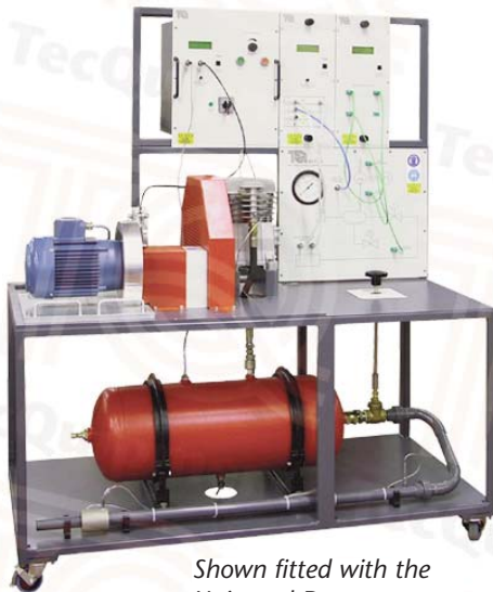
Shown fitted with the Universal Dynamometer