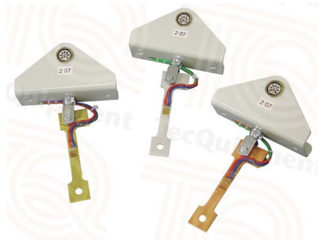
Optional Tension Specimens (SM1009a)