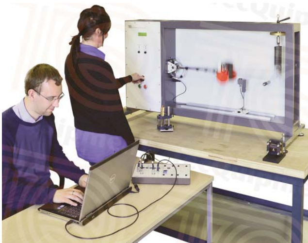
The TM1016 in use (other items not included)