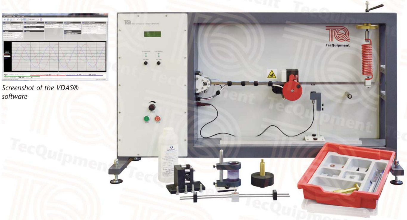
Screenshot of the VDAS ® software