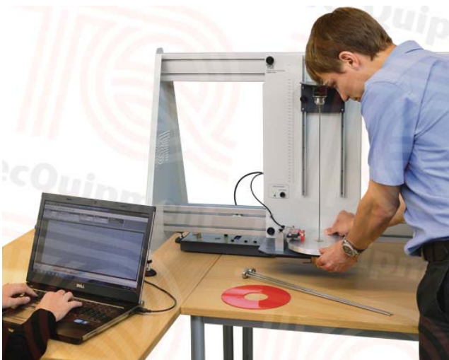
The TM165 in use (other items not included)