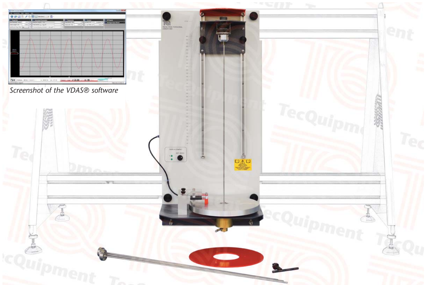
Screenshot of the VDAS ® software