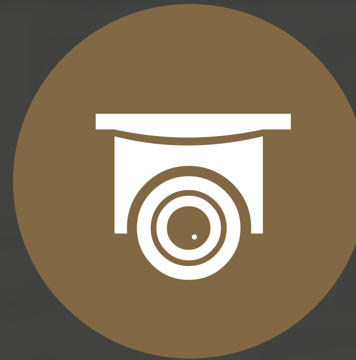
Full HD PTZ camera