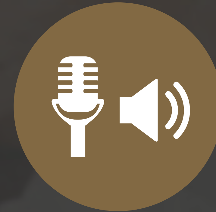
Microphone & audio system